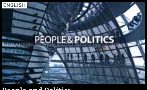
People and Politics