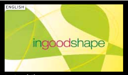
In Good Shape

A unique look at today's world, featuring exclusive reports on current events and in-depth stories about what moves and inspires people around the globe.