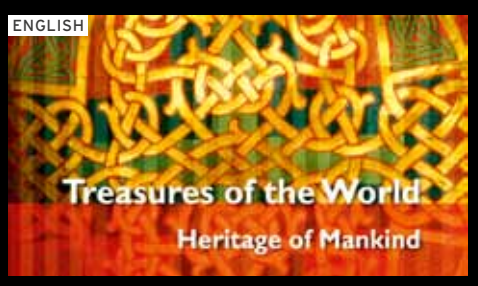
Treasures of the World