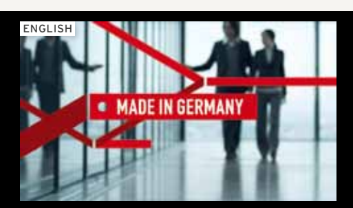
Made in Germany

Kino is on the set of the German film industry and international film productions in Germany: close-ups of the actors and directors, screenplay writers and producers of the moment.